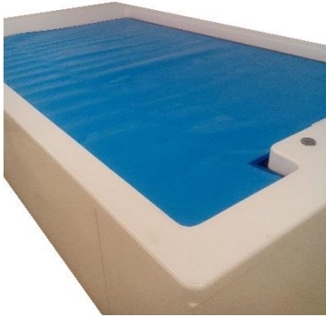
Derwent and The Lakes Pools