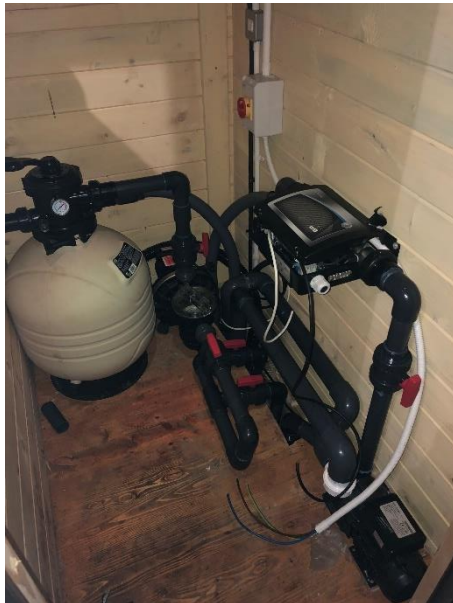
Plant Room Example